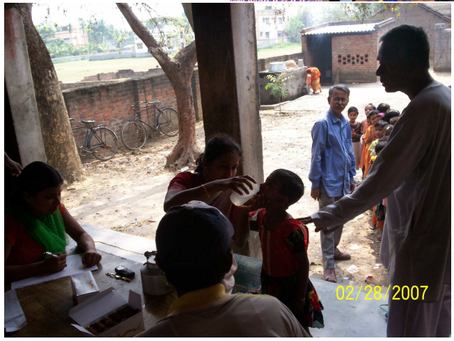
Deworming of children Programme on 28/02/07

The skill orientation of learners was effectively pursued by introducing Crash Course in Communicative English and Basic Computer Literacy for all students. Besides, the students of